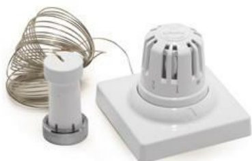
B1701 Liquid head with remote adjuster