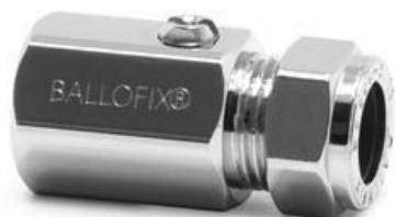
3331ZA Ball valve

Ballofix isolating ball valve - straight pattern. Compression x BSP parallel female thread. DZR, commercial chrome finish