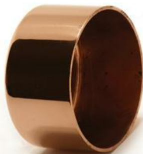
N61DW Stop End