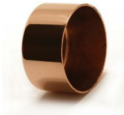
N61 Stop End