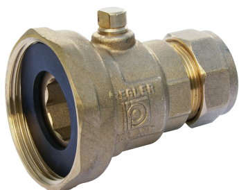
PB300P Ball pump valve

Circulator pump isolating ball valve pair