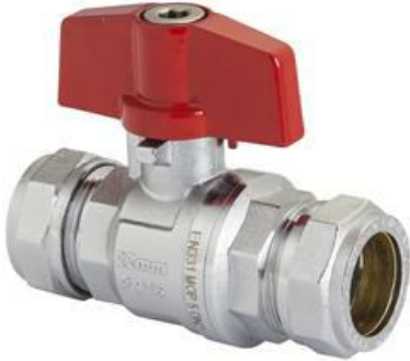
PB300T Ball valve

Chromium plated brass full bore ball valve (red "T" handle) PN16. Compression ends to EN 1254/2.CE