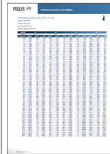
Pressure Loss Tables: Copper Compressed Air